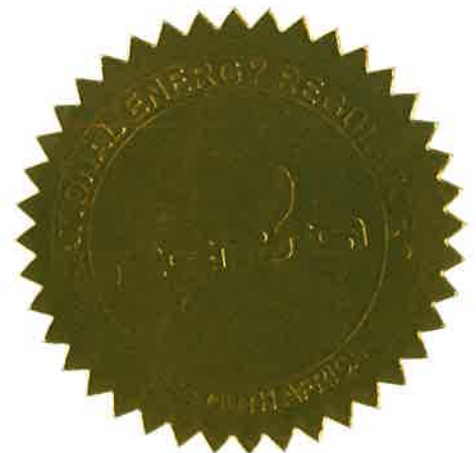
CHIEF EXECUTIVE OFFICER NATIONAL ENERGY REGULATOR OF SOUTH AFRICA