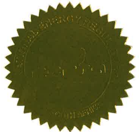
CHIEF EXECUTIVE OFFICER NATIONAL ENERGY REGULATOR OF SOUTH AFRICA

A handwritten signature in black ink, appearing to read 'D. M. M. M.', is written over a horizontal line.