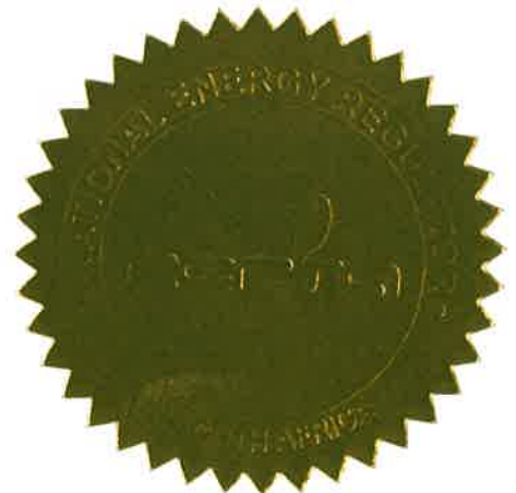
CHIEF EXECUTIVE OFFICER NATIONAL ENERGY REGULATOR OF SOUTH AFRICA