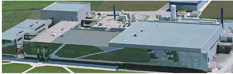
Soitec semiconductor manufacturing site for engineered substrates in France