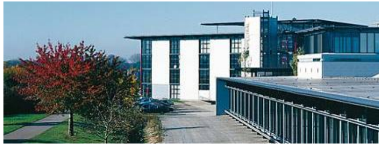
Soitec manufacturing site for CPV modules in Germany